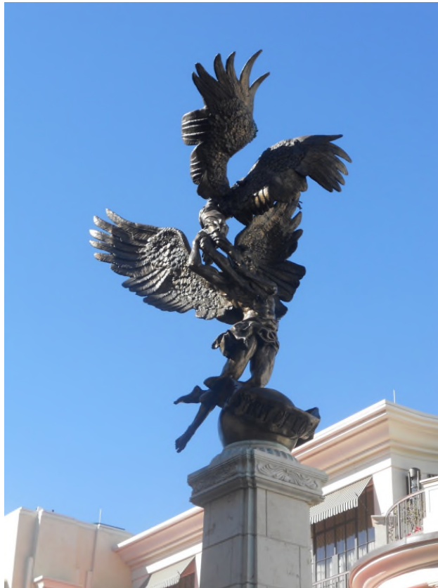
Spirit of Los Angeles

The Angel adorns trophies worldwide as the acknowledged and recognized symbol of good over evil and triumph over defeat. The Angel inspires and comforts. It unifies and captivates. Your choice of the ARCHANGELS ™ promises success.