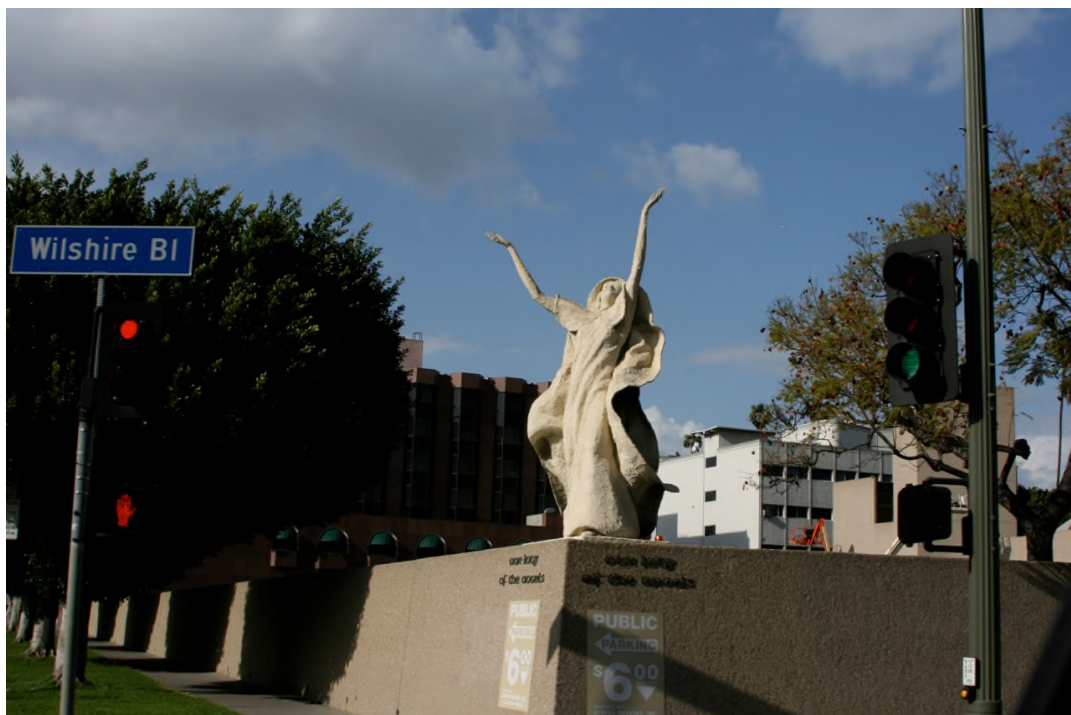
Our Lady of the Angels

The name Los Angeles is Spanish for "the Angels". The original name was "El Pueblo de Nuestra Señora la Reina de los Ángeles de Porciúncula" On August 2, 1769, a Franciscan priest, Father Juan Crespi, accompanying the first European land expedition through California, came upon a beautiful river named Nuestra Señora de los Angeles de la Porciúncula . According to the Franciscan calendar, August 2 was the day on which the Feast of the Perdono was celebrated. Early in St. Francis' life, the Benedictines had given him a tiny chapel near Assisi. The chapel was ruined and in need of repair. On the wall behind the altar was a fresco of the Virgin Mary surrounded by angels. Contained within a Basilica, the chapel was named Saint Mary of the Angels at the Little Portion . The newly discovered "beautiful river" was named in honor of this celebration and this chapel. In 1781, a new settlement was established along that river which came to be known as El Pueblo de Nuestra Señora la Reina de los Angeles de Porciúncula or The Town of Our Lady the Queen of Angels of the Little Portion although its official name was simply El Pueblo de la Reina de Los Angeles .