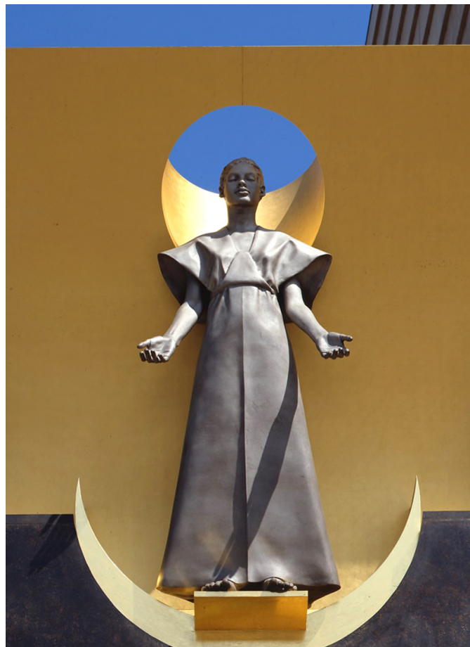
The Cathedral of Our Lady of the Angels

Los Angeles has a social and competitive tradition in this vein, struggling as it has over political, theological, and existential conflict. Man verses Man. Man verses Nature. Man, flawed and challenged, verses Himself and his better nature.