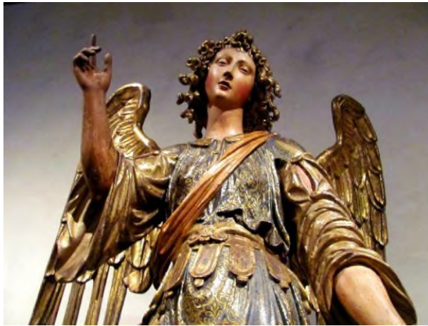
Los Angeles County Museum of Art

Los Angeles has a social and competitive tradition in this vein, struggling as it has over political, theological, and existential conflict. Man verses Man. Man verses Nature. Man, flawed and challenged, verses Himself and his better nature.